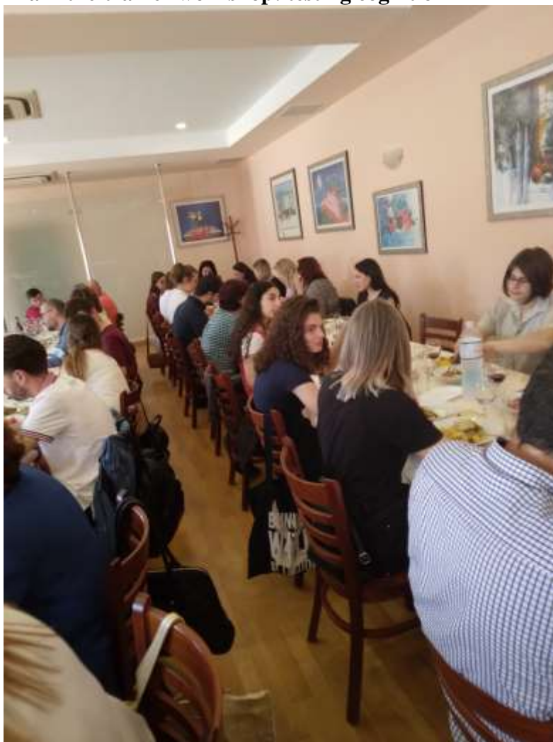
Train-the-trainer workshop: lunch at the UniWA restaurant