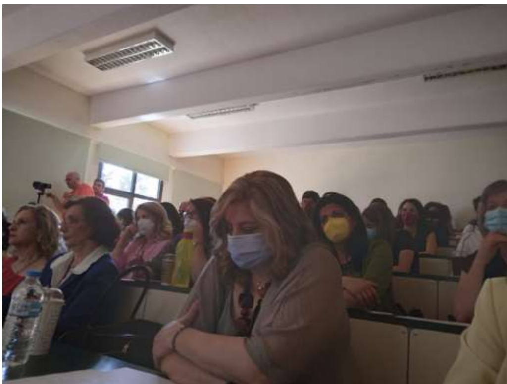
UniWA staff and students