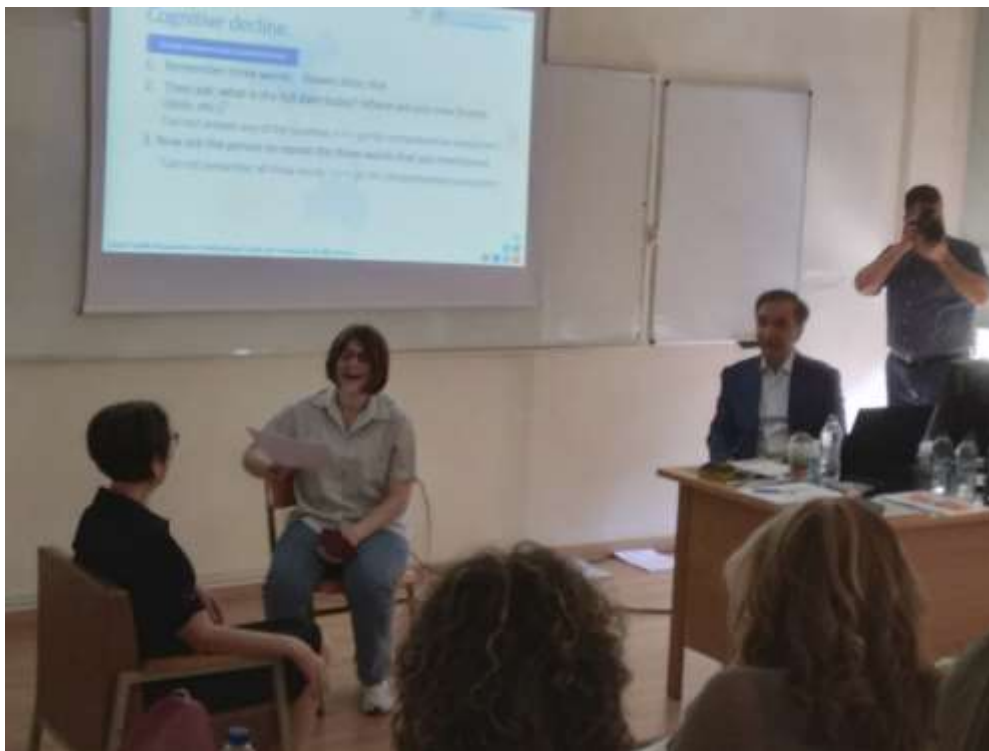
Train-the-trainer workshop: testing cognition