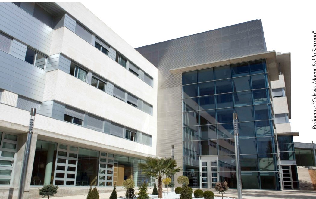
Residence "Colegio Mayor Pablo Serrano"

Located strategically between the Ebro valley and the Mediterranean sea, Teruel is a calm and pleasant town. It is the safest city in Spain and boasts a high quality of life. Due to its size, it is accessible and cosy, while offering all the public and private services of a modern town. It is an ideal place to live and study in an atmosphere full of history, art and culture.